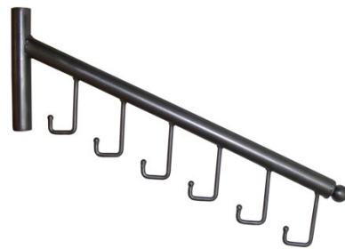
1 pcs – Arm