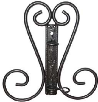
1 pc – Holder